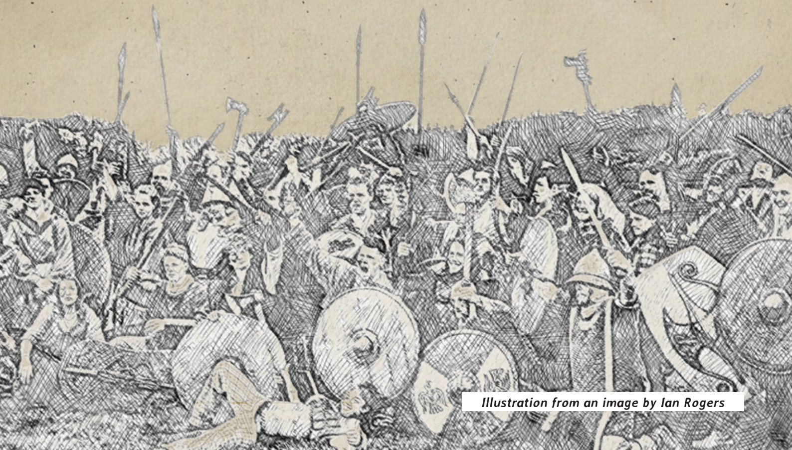
Illustration from an image by Ian Rogers

And for more Crew Woo, visit the DC CREW ONLY group on Facebook.